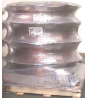
Skids (45" x 45" x 45")

Skid Package cannot be stacked 2 high during transit or while in stock!