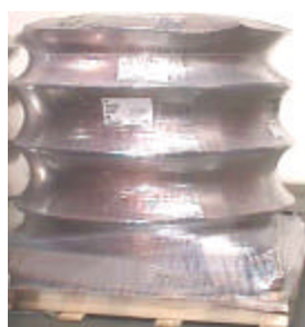
Maximum Skid Size (45" x 45" x 45")